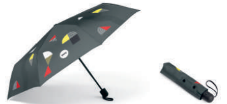
MINI GRAPHIC FOLDABLE UMBRELLA

100% polyester (recycled PET) Sage/Multi-coloured 80 23 5A51699 Closed: 27 x 6 cm Handle: 5 x 4 cm Diameter: 98 cm