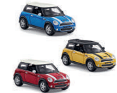
MINI COOPER S PULL BACK

95% cotton, 3% polyester, 2% viscose Chili Red 80 45 2454546 26 x 14 x 13 cm