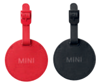
MINI LUGGAGE TAG

100% polyester (recycled PET) Sage/Multi-coloured 80 23 5A51698 Length: 82.2 cm Handle: 13.5 x 3.3 cm Diameter: 99.5 cm