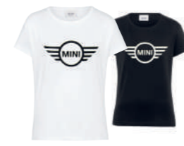
MINI TWO-TONE WING LOGO T-SHIRT WOMEN'S

100% cotton (organic) Sage/Multi-coloured XXS-XL 80 14 5A21554-59