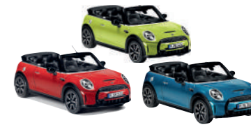
MINI CONVERTIBLE COOPER S MINIATURE

Die-cast Chili Red 80 43 5A21536 Island Blue 80 43 5A21537 1:18 scale