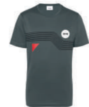
MINI GRAPHIC WORDMARK T-SHIRT MEN'S

100% cotton (organic) Sage/Multi-coloured S-XXXL 80 14 5A21589-94