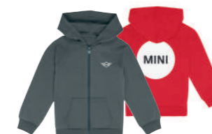
MINI WORDMARK CIRCLE ZIP HOODIE KIDS

100% cotton (organic), UV protection finish Sage/Multi-coloured 98-140 80 14 5A21638-45