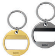
MINI COLOURED BOTTLE OPENER KEYRING

Anodised aluminium, satin finish Black/Silver 80 24 2460900 13 x 1.2 x 1.2 cm