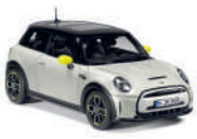
MINI COOPER SE MINIATURE

Plastic Box of 24 in 3 colours (Electric Blue, Volcanic Orange, Chili Red) 80 44 2447939 1:36 scale