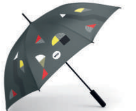
MINI GRAPHIC WALKING STICK UMBRELLA

100% polyester (recycled PET) Sage/Multi-coloured 80 23 5A51699 Closed: 27 x 6 cm Handle: 5 x 4 cm Diameter: 98 cm