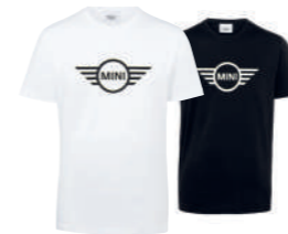
MINI TWO-TONE WING LOGO T-SHIRT MEN'S

100% cotton (organic) Sage/Multi-coloured S-XXXL 80 14 5A21589-94