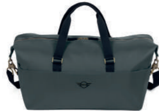
MINI TWO-TONE LOGO TRAVELLER BAG

Material: 100% cotton (waxed) Lining: 100% polyester Sage 80 22 5A51686 23 x 16 x 35 cm