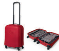
MINI KIDS TROLLEY

Wing logo: debossed Shell: 100% polycarbonate Lining: 100% polyester Sage 80 22 5A51691 Black 80 22 5A0A671 71 x 48.5 x 27.5 cm Volume: 76 l