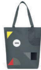
MINI GRAPHIC SHOPPER

Material: 100% cotton (waxed) Lining: 100% polyester Sage/Multi-coloured 80 21 5A51684 19 x 2 x 10 cm