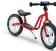
MINI BALANCE BIKE

Biodegradable acetate Lenses: Zeiss Cleaning Cloth: recycled PET Foldable Case: recycled PET Black/Energetic Yellow 80 25 5A0A704