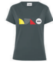
MINI GRAPHIC WORDMARK T-SHIRT WOMEN'S

100% cotton (organic) Sage/Multi-coloured XXS-XL 80 14 5A21554-59