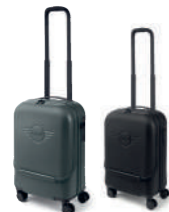
MINI CABIN TROLLEY

Material: 100% cotton (waxed) Chili Red 80 21 5A0A662 Black 80 21 5A0A663 8.5 x 8.5 x 0.4 cm