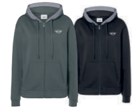
MINI STRIPED BINDING ZIP HOODIE WOMEN'S

95% cotton (organic) 5% elastane Sage XXS-XL 80 14 5A21568-73