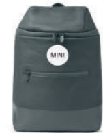
MINI WORDMARK CIRCLE BACKPACK

Material: 100% cotton (waxed) Lining: 100% polyester Sage/Multi-coloured 80 22 5A51685 45 x 27 x 27 cm