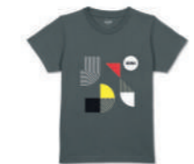
MINI GRAPHIC WORDMARK T-SHIRT KIDS

65% polyester, 35% cotton Chili Red OS (53 cm) 80 16 5A51680