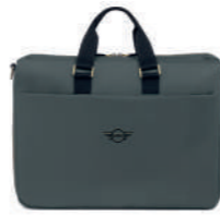
MINI TWO-TONE LOGO LAPTOP BAG

Material: 100% polyester (recycled PET) Lining: 100% polyester Sage/Black 80 22 5A51687 26 x 3 x 13 cm