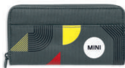
MINI GRAPHIC WALLET

Material: 100% cotton (waxed) Lining: 100% polyester Sage/Multi-coloured 80 21 5A51682 20 x 11 cm