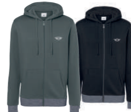
MINI STRIPED BINDING ZIP HOODIE MEN'S

95% cotton (organic) 5% elastane Sage S-XXXL 80 14 5A21617-22