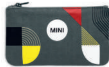
MINI SMALL GRAPHIC POUCH

Material: 100% cotton (waxed) Lining: 100% polyester Sage/Multi-coloured 80 21 5A51682 20 x 11 cm