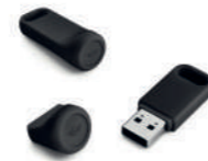
MINI USB KEY

Stoneware Sage/Multicoloured 80 28 5A51697 Capacity: 0.3 l