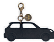
MINI CAR CHARM

Charm: 100% leather (recycled) Carabiner with MINI Wing Logo pendant Black 80 23 5A51692 10 x 3.8 cm