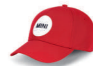
MINI WORDMARK CIRCLE CAP KIDS

65% polyester, 35% cotton Sage OS (57 cm) 80 16 5A51678 White OS (57 cm) 80 16 5A52A83