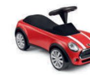
MINI BABY RACER

Aluminium Chili Red 80 93 5A21521 Length: 92 cm Height: 76 - 110 cm