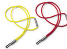
MINI TUBE LANYARD

ABS with rubber finish, 32 GB Black 80 29 5A0A693 1.8 x 1.8 x 4.5 cm