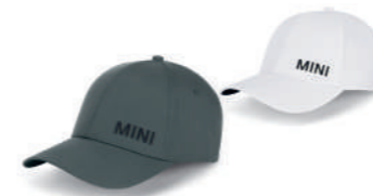
MINI TWO-TONE WORDMARK CAP

100% cotton (organic) Sage S-XXXL 80 14 5A21624-29 Black S-XXXL 80 14 5A21631-36