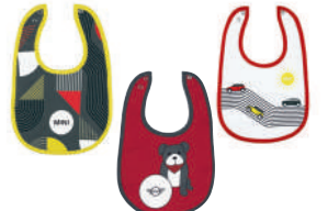
MINI GRAPHIC BIBS GIFT SET

100% cotton (organic) Sage 98-140 80 14 5A21647-54 Chili Red 98-140 80 14 5A21656-63