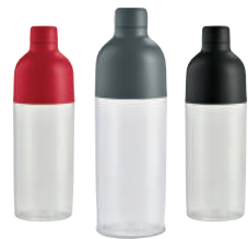
MINI COLOUR BLOCK WATER BOTTLE

Bar: Chrome-plated steel Silver/Black 80 93 2463105