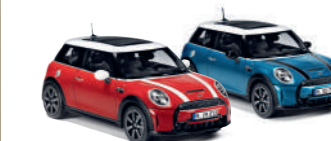
MINI COOPER S MINIATURE

Brushed zinc alloy, Nylon rope MINI Wing Logo Silver/Black 80 27 2445685 MINI Wordmark Silver/Black 80 27 2445686 19 x 1.8 x 0.7 cm