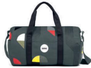
MINI GRAPHIC DUFFLE BAG

Material: 100% cotton (waxed) Sage/Multi-coloured 80 22 5A51683 40 x 40 x 14 cm