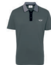
MINI STRIPED COLLAR POLO MEN'S

100% cotton (organic) White/Black S-XXXL 80 14 5A21603-08 Black/White S-XXXL 80 14 5A21610-15