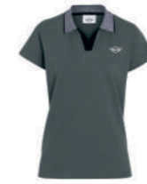
MINI STRIPED COLLAR POLO WOMEN'S

100% cotton (organic) White/Black XXS-XL 80 14 5A21561-66 Black/White XXS-XL 80 14 5A21596-601